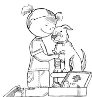
First Aid Class